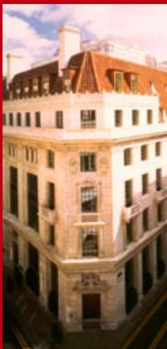
The Baltic Exchange