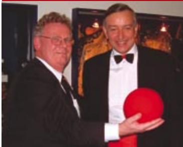
Just Like That!

Civic Luncheon..... 1 It was Magic!.....1