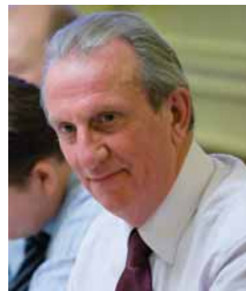
Livery companies and Ward Clubs of the City.

Do please continue with your support of events. Costings are based on minimum numbers to cover venue hire and in an attempt to keep ticket prices as low as possible, there is little slack if numbers are not maintained. Do please bring a guest or introduce a potential member at a future event. Remember both HMS President and the Burns Night events are open to all the