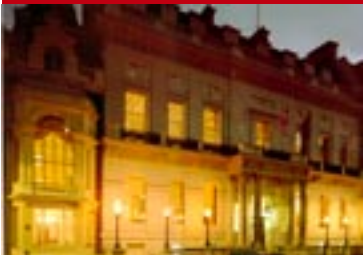
(Oxford & Cambridge Club)

Dickensian Luncheon.....1 Reciprocal Clubs.....1