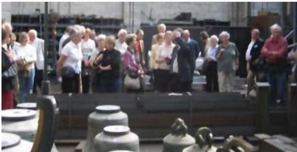
Belles among the Bells!