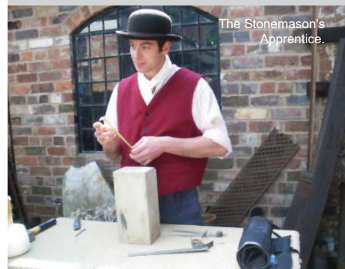
The Stonemason's Apprentice.

At Blists Hill we started at the top with its traditional pub, shops and workshops. The photo shows a Stonemason's Apprentice preparing a test piece for his Master dressed in traditional Victorian clothing. We went from Blists Hill to other sites in the area including china and glass works, then to lunch. The afternoon continued with visits to other parts of the Trust.