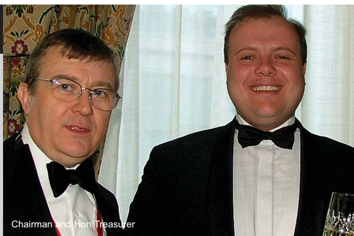
Chairman and Hon Treasurer