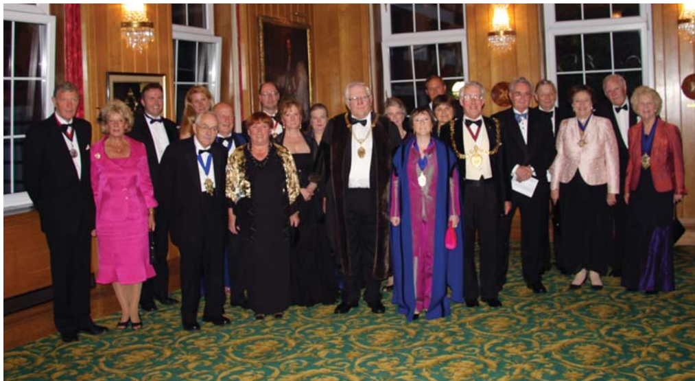
President, Officers and Guests - Annual Banquet

Supporting the Lord Mayor, the City Corporation and the Livery Companies since 1914