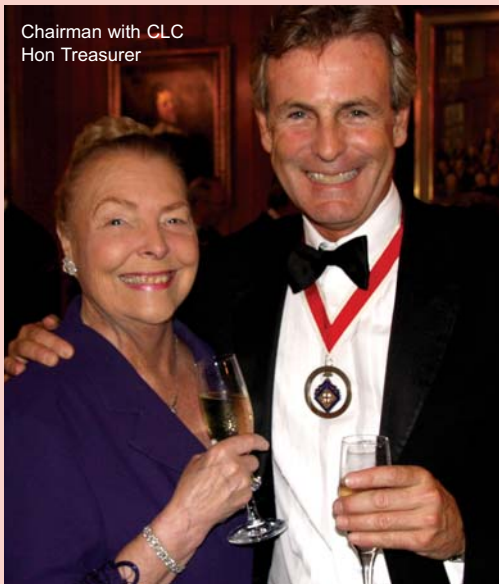
Chairman with CLC Hon Treasurer

St.Paul's Cathedral was our venue on Monday 22 September for a Champagne Reception, a Musical and Historical Presentation with Supper in the Crypt as part of the Dean and Chapter's 300th Anniversary celebrations of the "Topping-